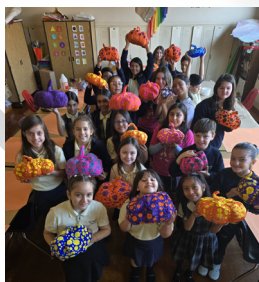
Art Club PUMPKIN Project