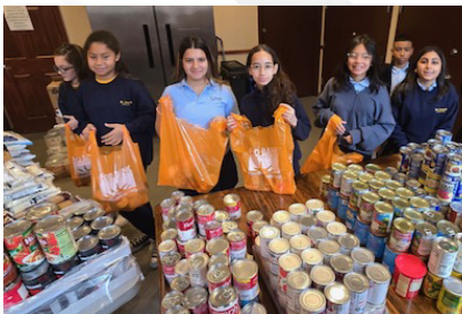
Students performing service at the parish pantry for needy people at Thanksgiving

Our mission to develop the whole child is exemplified by the many and varied co-curricular programs offered that include the world languages of Spanish and Mandarin Chinese, drama, filmmaking, band, music, art, physical education, modern dance, and yoga/mindfulness. This year, we have added a Wednesday activity period to the weekly schedule which gives students the opportunity to choose a different activity each trimester among the following offerings: chess, service, basketball clinic, coding, creative writing, yearbook, robotics, art, and yoga.