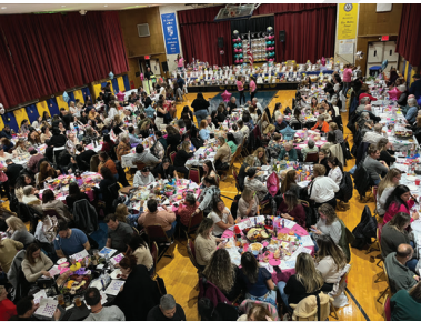
Radio Bingo guests enjoying themselves

Our parents are one of the greatest sources of support at the academy. In addition to volunteering to give tours to prospective parents at registration time, the association hosts various events that contribute to the financial stability of the academy as well as building school spirit. In October, the parents organized a highly successful Trunk or Treat event in the school yard for the children. November saw the third annual BINGO extravaganza – the last two years of which was a RADIO BINGO event – which hundreds of participants fully enjoyed. In addition to the assistance received from parents at the Christmas production, the HAA sponsored a Christmas Market open to the public as well as a Holiday Craft Sale that enabled the children to purchase reasonably-priced gifts for family members. Our attention now turns to preparations for the 145th Anniversary of the school's founding to take place on April 12.