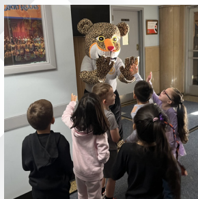
Giving a high-five