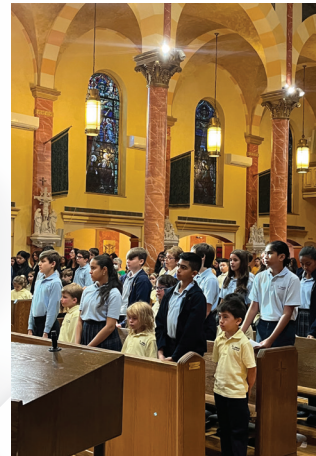
Big and Little Brothers and Sisters attend Mass of the Guardian Angels together

In addition to the religious instruction that takes place in daily Religion class, and the opportunities for prayer and monthly liturgical celebrations, we teach the students about the importance of putting their faith into action. In conjunction with the HAA, the Faith in Action Program was begun several years and provides age/grade appropriate activities that involve the children in doing something for others. In addition to the Thanksgiving Food Drive, in December the children from all classes made drawings or wrote letters to needy people including veterans, the elderly in nursing facilities in the area, hospitalized children in Croatia, and children of Ukrainian, Islamic, and Jewish descent whose families have been impacted in some way by the ravages of war around the world.