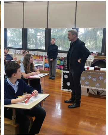
Bishop speaks to students during Catholic Schools Week 2024