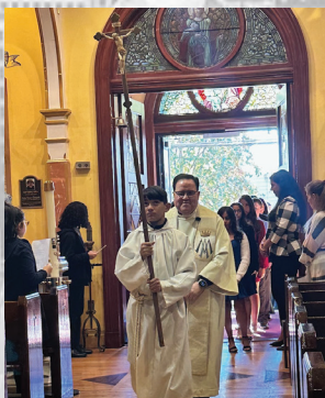
Ring Day process into church