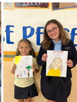
Third and sixth graders with self portraits