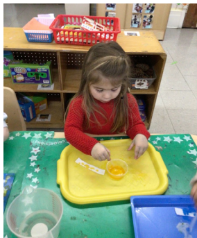
PreK solving a math problem