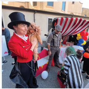
Trunk or Treat anyone?