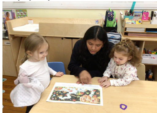
Older student getting service credit by reading to 3Kers