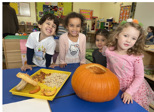
PreK pumpkin exploration in science

We take pride in our early childhood program, as it lays the critical foundation for a lifelong love of learning. The nurturing, stimulating environment we provide helps ensure that students build confidence, curiosity, and a strong academic and social-emotional foundation as they continue their educational journey at St. Joseph Catholic Academy.