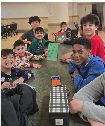
First and Eighth graders playing a game at Christmas

The Big and Little Brothers and Sisters Program began over fifteen years ago and has been reinstated after a two-year pause during the Covid pandemic. The program's organization is simple: older children are paired with younger children, e.g., kindergarteners and sixth graders, first and eighth graders, and so on. The older students get the chance to be good examples to their young counterparts while the younger learn from them. All students learn valuable life lessons of teamwork and responsibility. Whether it's attending monthly liturgies together, celebrating seasonal special events together, or participating in other community spirit building activities – special bonds are formed and developed. The program is educational, inspirational, and fun for the children and adults alike.