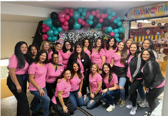
Mom Volunteers at Radio Bingo