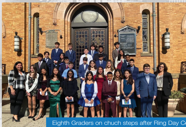
Eighth Graders on church steps after Ring Day Ceremony in October