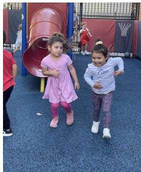
PreK at the playground